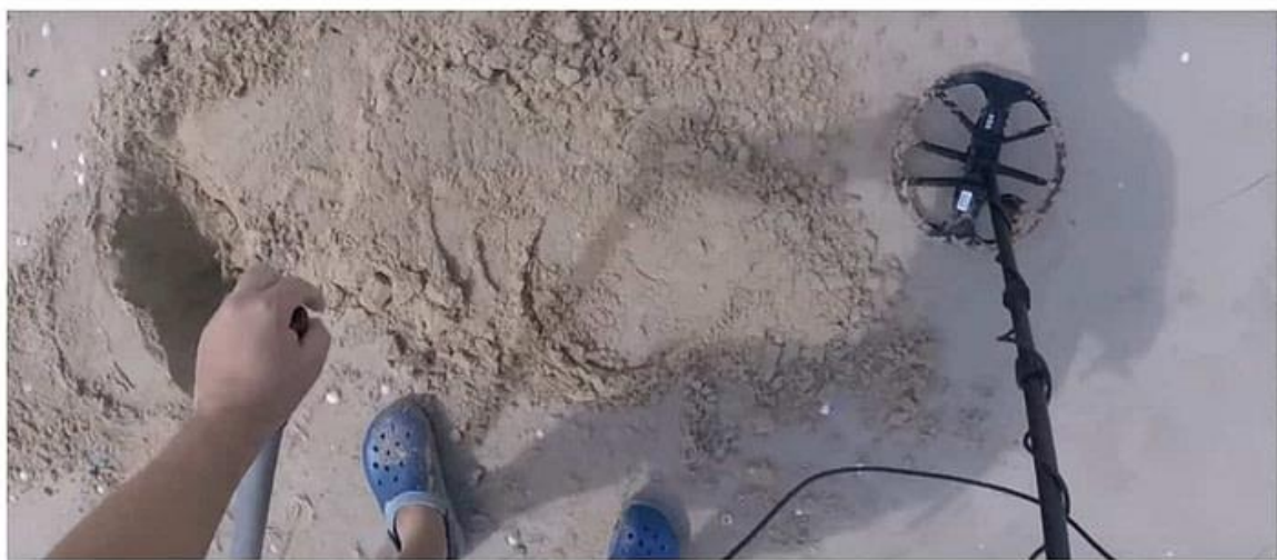
Metal Detecting on the Beach

Just because your device has started beeping don't jump into thinking you have found your target. Have you ever tried digging into sand? It is much more frustrating than digging soil. Soft sand is considered almost impossible to dig. As soon as you dig a hole, sand from the side slips back in filling the hole. This keeps on happening till infinity.