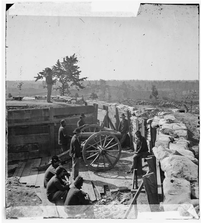
Atlanta, Ga. Federal soldiers by gun in captured fort]